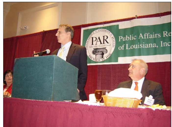
Above: PAR officers and presenting sponsors welcome keynote speaker John M. Barry

Serving on advisory boards for M.I.T. and Johns Hopkins University, as well as the newly consolidated Louisiana Flood Control Authority, Barry was able to provide a unique perspective on Louisiana's recovery efforts and its role in creating a quality economy for other parts of the nation by bearing the brunt of hurricanes Katrina and Rita.